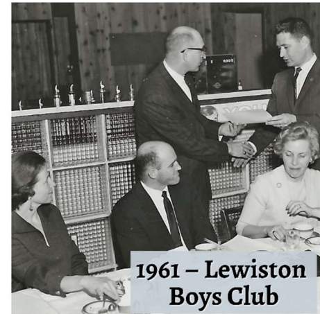
1961 – Lewiston Boys Club