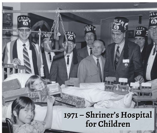
1971 – Shriner's Hospital for Children