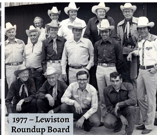
1977 – Lewiston Roundup Board

Downtown Lewiston was a bustling and fun "place to be" from the 1940s into the 1960s. Most of the community and civic events were held downtown where everyone went for the best retail stores, cafes and restaurants, movies and entertainment, and large meetings and events. The favorite places for business lunches and after-hours dinner, drinks, parties and events were the Elks Lodge, Bollinger Hotel and Lewis Clark Hotel.