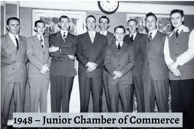
1948 – Junior Chamber of Commerce