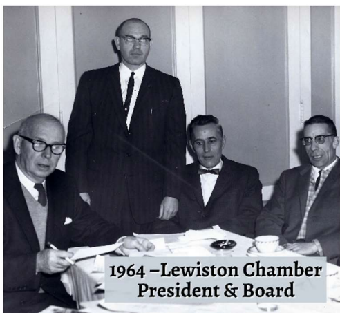
1964 – Lewiston Chamber President & Board