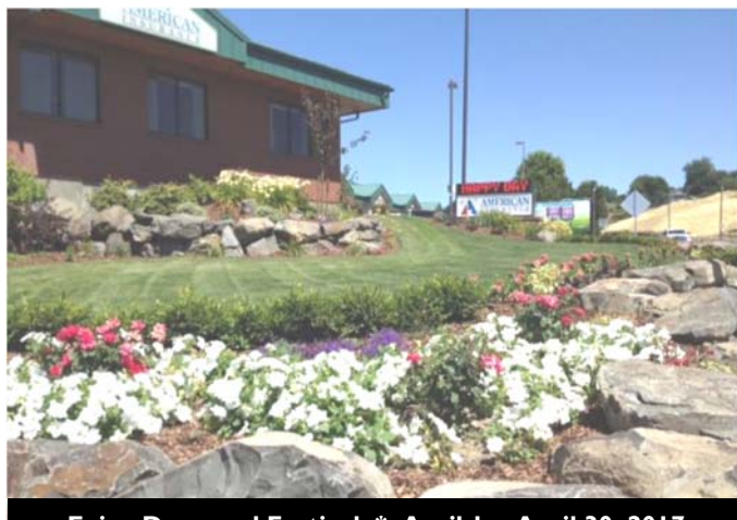
Enjoy Dogwood Festival * April 1 - April 30, 2017